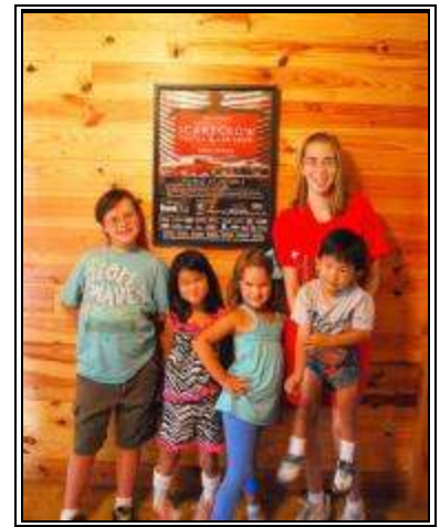
Pictured are some children that spend time at the Hope Hollow camp.

Also, once again, Hope Hollow will be joining this year's event with a huge silent auction. Some of the unbelievable silent auction items collected thus far include several trips including a one week trip to Italy's Tuscany Valley and a one week African Safari. These are just a few of the many silent auction items that will be up for auction at the Scarecrow event in October. Hope Hollow is a camp for children with disabilities located on Catlett Road between Madison and Canton. To learn more about Hope Hollow visit www.hopehollowms.org .